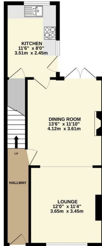
GROUND FLOOR 468 sq.ft. (43.5 sq.m.) approx.